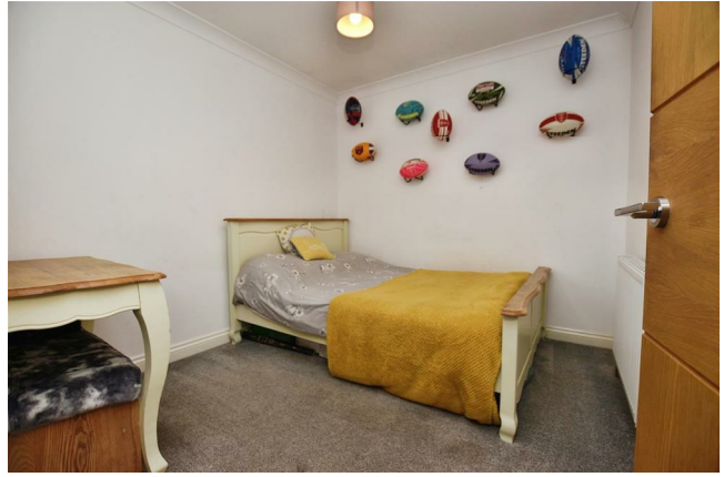
Bedroom Three 9'6" x 8'7" (2.92 x 2.62)

A further double bedroom with double glazed window and radiator.