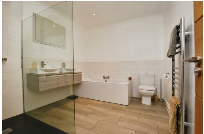
Family Bathroom 9'8" x 8'8" (2.95 x 2.66)

The family bathroom has a four piece suite to include: panelled bath, low level W.C., his and hers wash basins with useful storage drawers below and large walk in shower cubicle. Tiled flooring and chrome towel heater.