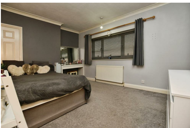
Bedroom Two 13'7" x 10'0" (4.15 x 3.05)

A further double bedroom with double glazed window and radiator.